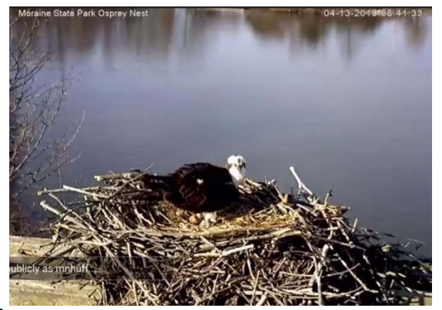
Female revealing third egg