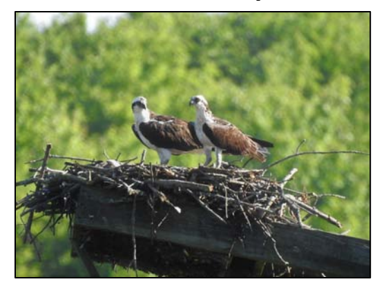
Female - Left, Male - Right