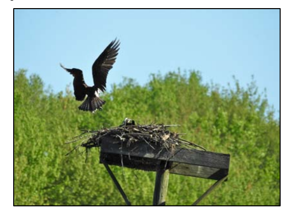
Food delivery by male