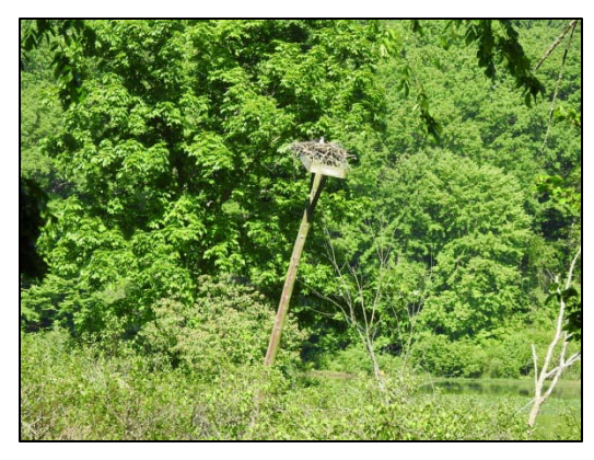
This is the first season the nest has been used in quite some time. They seemed to adjust to the angle quite well.